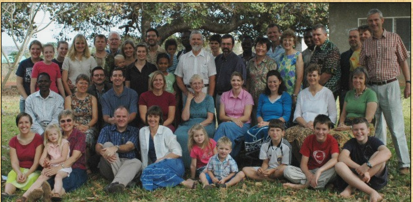
All of us at conference in Nampula, Mozambique

We are so very grateful to all of you, our dear family and friends. Thank you for upholding us in prayer and supporting us financially so that we can serve the Lord wherever we happen to be.