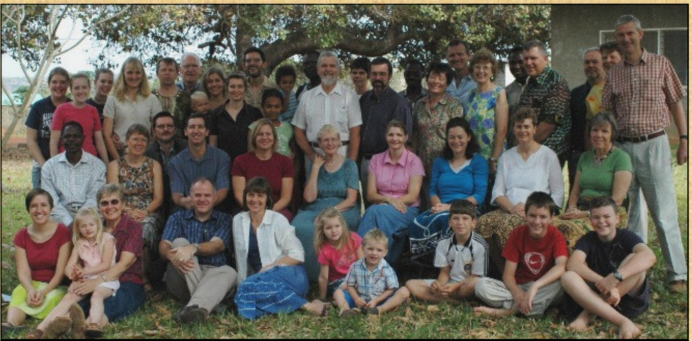
All of us at conference in Nampula, Mozambique

We are so very grateful to all of you, our dear family and friends. Thank you for upholding us in prayer and supporting us financially so that we can serve the Lord wherever we happen to be.